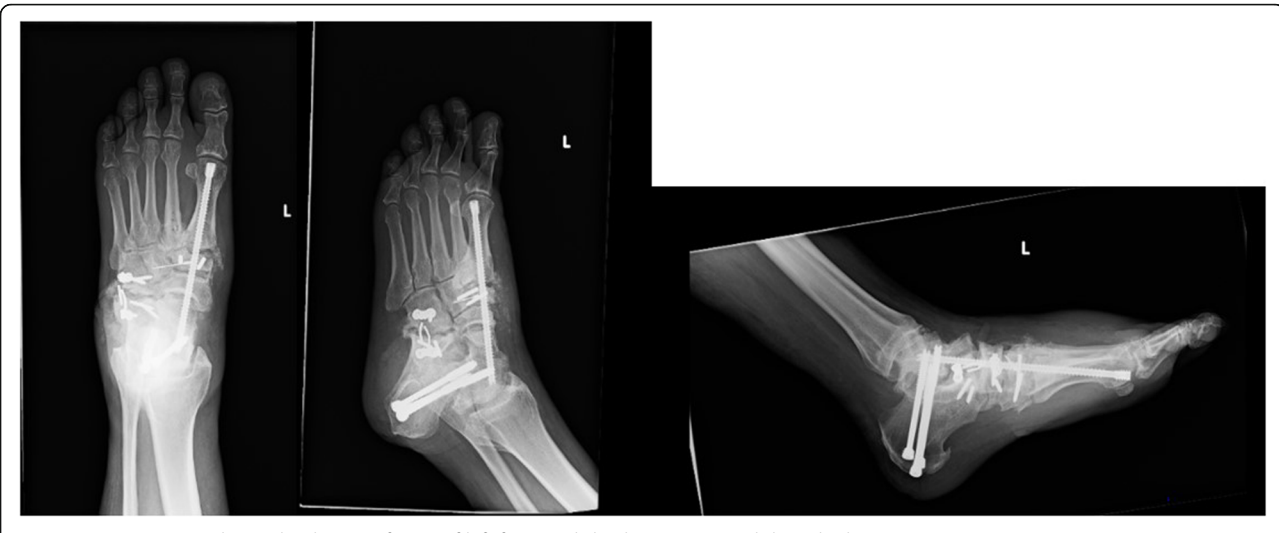
Fig. 2 postoperative radiographs showing fusion of left foot medial column joints and the subtalar joint

Khalifa et al. Patient Safety in Surgery (2020) 14:35 Page 3 of 10