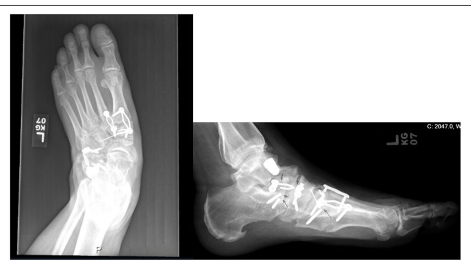
Fig. 1 preoperative Radiographs showing failure of the fixation construct and the patient developed Charcot arthropathy of the midfoot

In the immediate postoperative period, the patient complained of 10/10 pain to the right (contralateral) hip and posterior gluteal compartment radiating to the right lower extremity. The patient was more comfortable with the bed at 45 compared to lying flat. An emergent CT scan was obtained to rule out a fracture of the femoral neck or proximal femur and it was negative and did not show any other abnormality around the pelvis area. Due to his prior history of lumbar spine surgery, degenerative changes in the lower lumbar spine with marked narrowing of disc space, and sclerosis of endplates and osteophytes were seen on CT, a presumptive diagnosis of a herniated disc and/or compression of the sciatic nerve was made. An urgent MRI was also ordered that night; however, the patient was unable to lay supine due to pain and the only way to obtain the MRI was under anesthesia. Due to his recent prolonged surgery, a