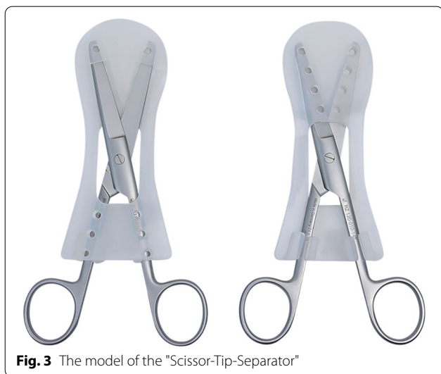
Fig. 3 The model of the "Scissor-Tip-Separator"

tors" in the sterile paper. Finally, the Minor Sets were subjected to steam sterilization.