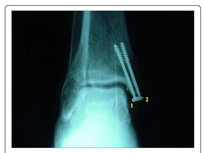
Figure 6 Antero-posterior view of the ankle of the same specimen shown on Figure 4. The observers were asked to refer screw positioning related to screws number 1 and 2.