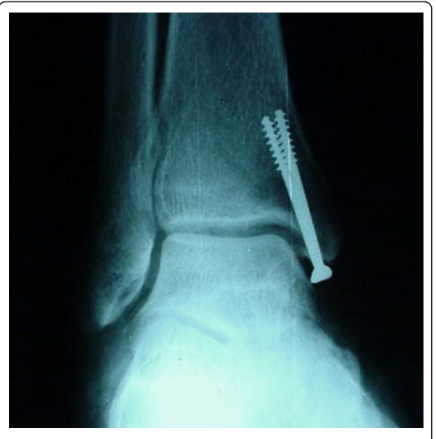
Figure 3 Mortise view of the ankle of one specimen with the medial screws inserted.

viewed independently by ten orthopaedic surgeons: five Trauma Surgeons and five Foot and Ankle Surgeons (Figures 5 and 6). This approach aims at describing higher order agreement by assessing agreement among groups of observers of decreasing size in a stepwise manner.