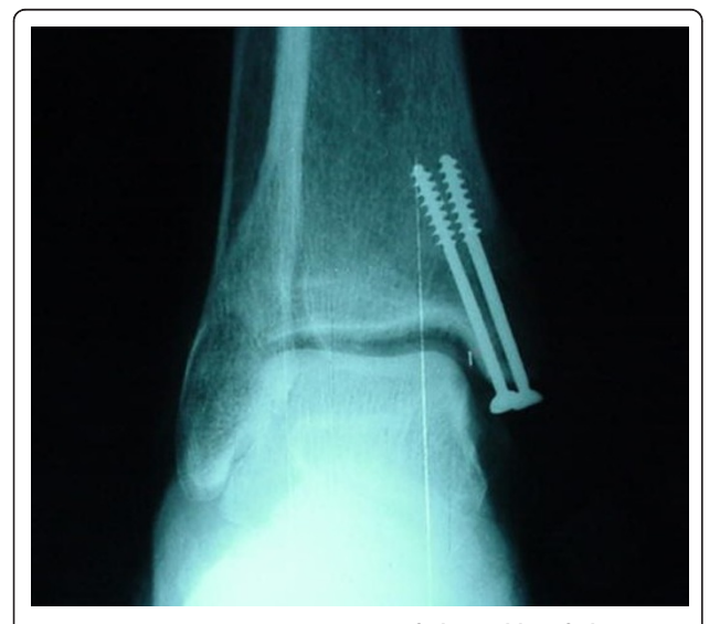
Figure 4 Antero-posterior view of the ankle of the same specimen shown on Figure 3.

do that. The questionnaire was elaborated following the Standards for Reporting of Diagnostic Accuracy (STARD) [15]. The selection of items was based on evidence whenever possible, therefore the "inconclusive" category was added. Inter and intraobserver variations were analyzed by kappa statistics, according to Svanholm et al and Brage et al [16,17]. The kappa-statistic was used to analyse agreement between more than two observers on an ordinal scale, on the basis of the analysis of every pair of observers [18]. The kappa-statistic measure of agreement was scaled to be one when there was perfect agreement and zero when the amount of agreement was what would