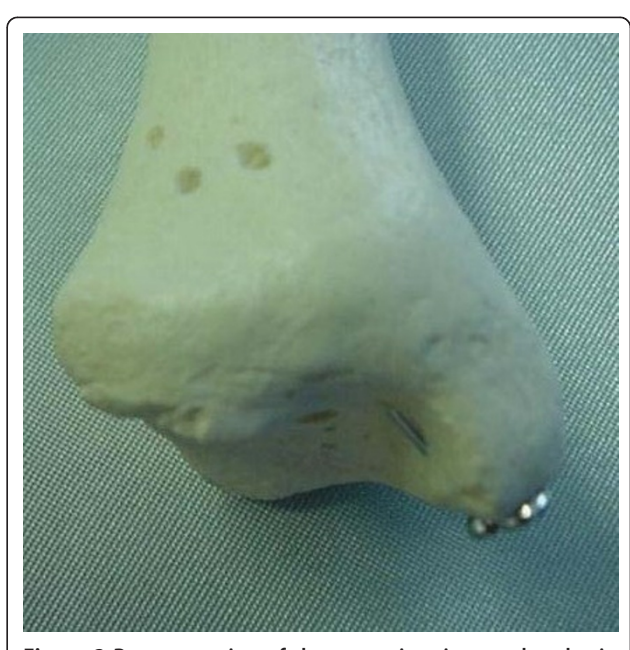
Figure 2 Representation of the same situation on the plastic bone.

investigation. The mortise view was made with the leg resting in a custom-made platform with 20 degrees of internal rotation. The films were photographed ( Cybershot, Sony, Japan), randomly included in CD-ROMs, and