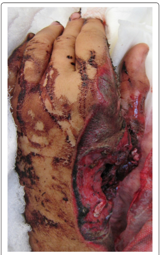
Figure 2 Crush amputated hand with extensive oil contamination involving all anatomic structures from the forearm to the midhand level.

regarding the most effective methods of oil decontamination from cutaneous wounds.