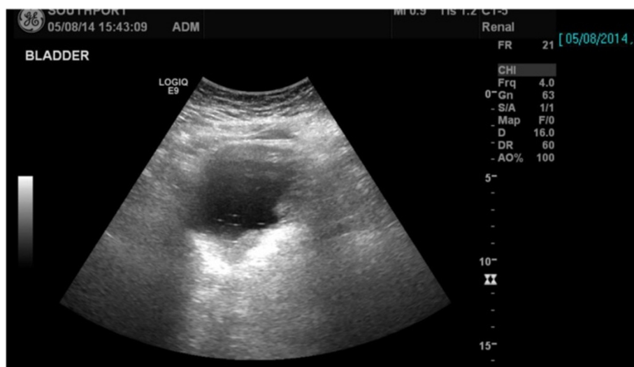
Figure 1 Ultrasound scan of urinary bladder: the balloon of Foley catheter is not seen, but the importance of this finding was not recognised by radiologist or by spinal cord physician.

24-hours ECG monitoring revealed bradycardia: slowest being 39 beats per minute (Figure 5), 214 episodes, and 36 beats at 00:09:04. There was a pause of 2.08 seconds at 22:14:51 (Figure 6). X-ray of pelvis revealed marked osteoarthritic changes in both hips; X-ray of lumbar spine