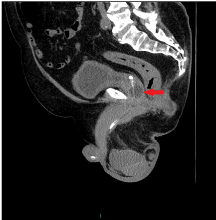
Figure 3 Sagittal section of CT of pelvis: the balloon of Foley catheter (arrow) is located in dilated prostatic-membranous urethra.