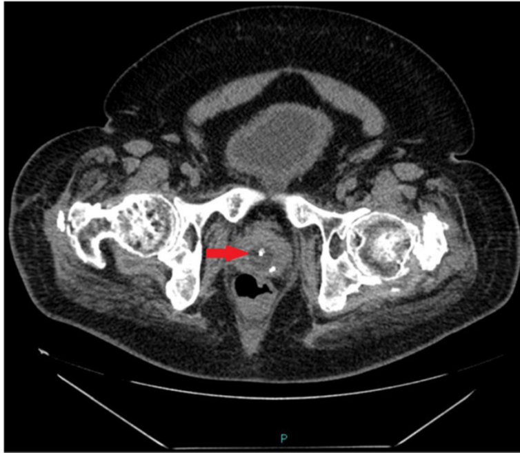
Figure 2 Axial scan of CT of pelvis performed ten days later: Neither the catheter nor balloon of Foley catheter can be seen inside the urinary bladder. The balloon of Foley catheter (arrow) is located in dilated prostate-membranous urethra.