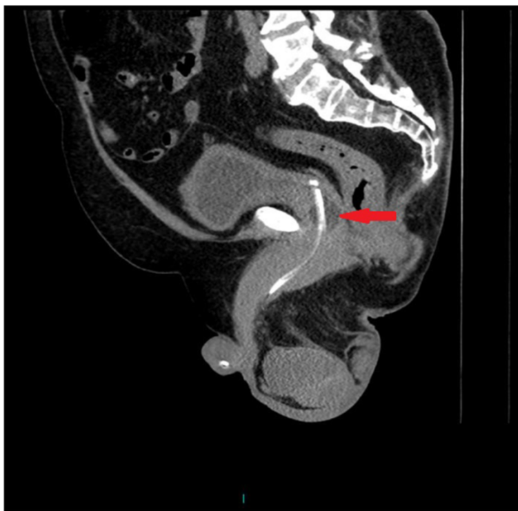
Figure 4 The tip of Foley catheter, which is radio-opaque, is not lying within the urinary bladder but it is located distal to bladder neck. The balloon of Foley catheter (arrow) is seen outside the urinary bladder within the urethra.

revealed slight scoliosis concave to the right; anterior hyperostosis, most marked at L4/5; disc spacing was well maintained.