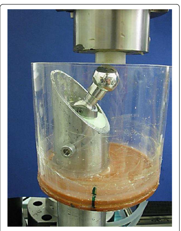
Fig. 3 Experimental setup for dynamic fatigue limit testing according to the ISO 7206–6 standard

The horizontal crack occurred above the modular connection (Fig. 4). The loosening torque of the metric screw connection M3 was similar to the tightening