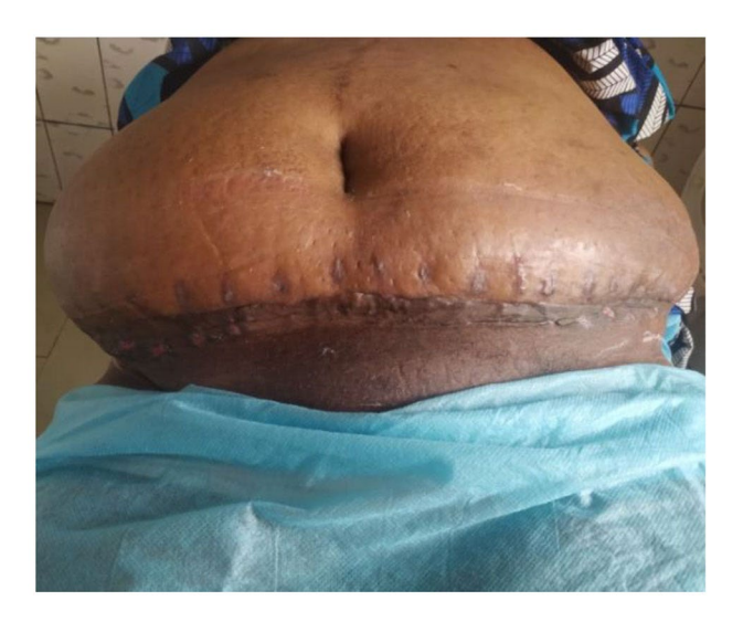
Fig. 3 Aspect of the scar at post-operative day 90

Obesity is a chronic metabolic disorder increasingly encountered in children, adolescents, adults, and pregnant women [11]. It is an independent risk factor for the occurrence of SSIs following many types of surgical