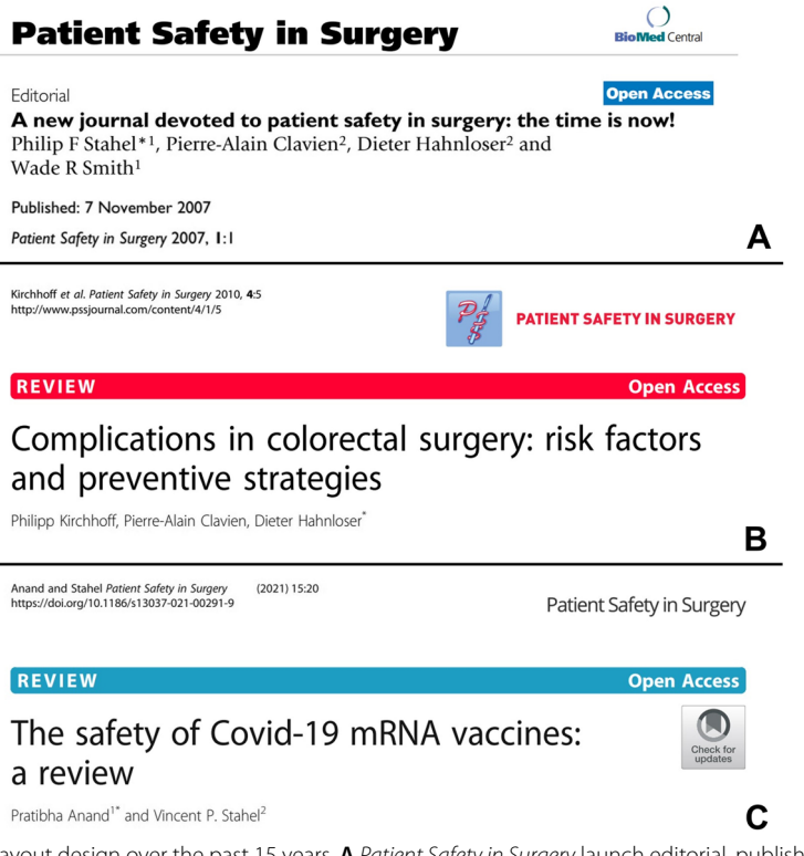
Fig. 1 Evolution of the journal's layout design over the past 15 years. A Patient Safety in Surgery launch editorial, published on November 7, 2007. B The journal's highest accessed and most cited article of all times, with 234,000 accesses and 231 citations at the time of publication of this editorial. C The journal's fastest high-citation publication of all times, with 216,000 accesses and 100 citations within two years of publication (May 1, 2021). This article was the #1 driver of the journal's first official impact factor (3.7) on June 28, 2023.