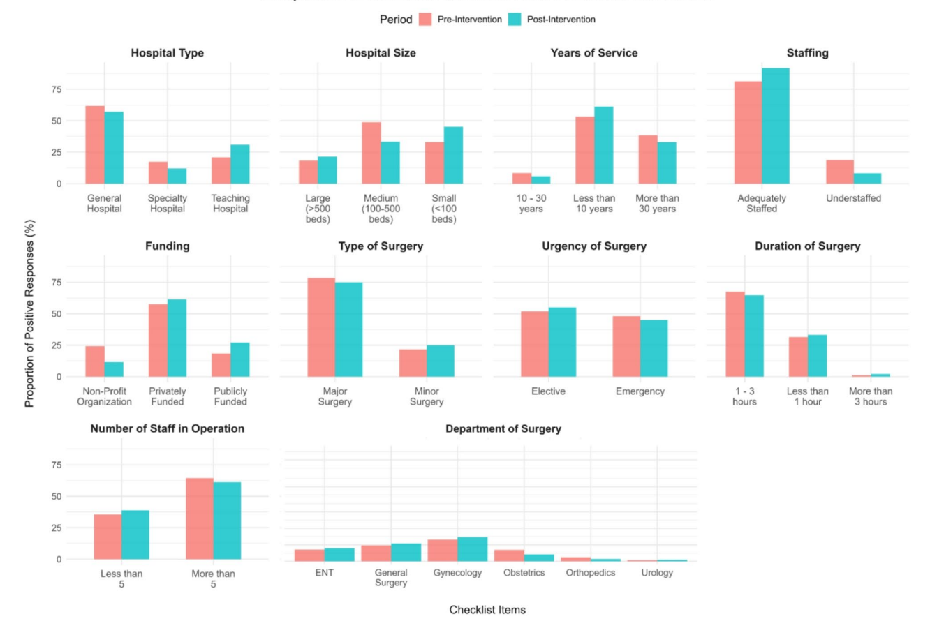
Comparison of Checklist Adherence Before and After Intervention