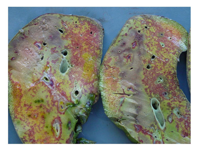
Figure 2 Sections of the right liver lobe. Note the parenchyma infarction with diffuse necrosis combined with hemorrhagic infiltration and cholestasis.

Many lessons can be learnt to prevent the occurrence of this iatrogenic combined injury of the bile duct, hepatic artery and portal vein during laparoscopic surgery for a benign disease.