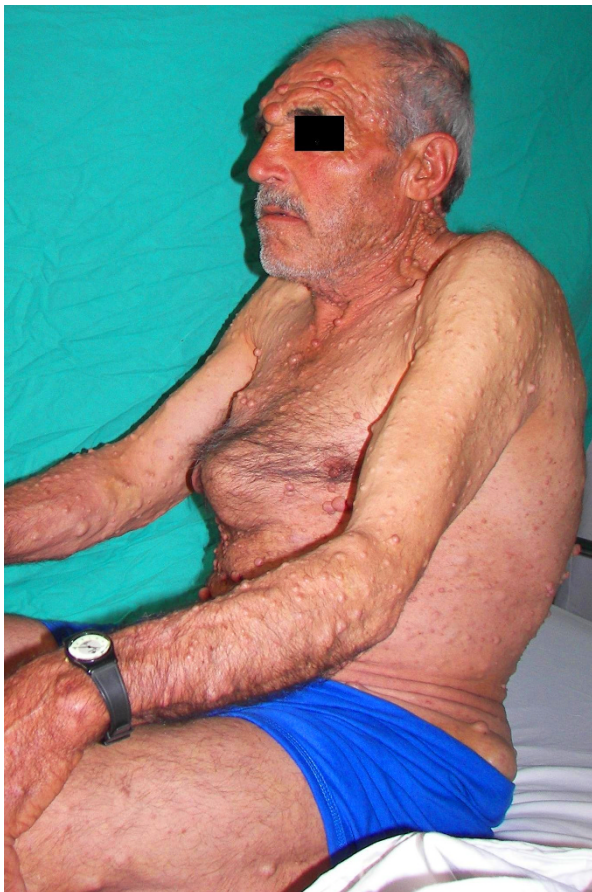
Figure 1 Pectus carinatum and neurofibromatosis of the patient.

On the other hand, according to patient's history, it was observed that the case had also had TMD (more apparent in the left temporomandibular joint) for about five years. Particularly, the case was complaining of sharp aches originating from the right pre-auricular zone and advancing towards the eye of the same side as well as periorbital and temporal areas. Another complaint of the case was the clicking sound that occurred while chewing. Indeed, mouth-opening was seen to be a fingerbreadth (approximately 1.35 cm) during the physical examination, therefore mallampati score could not be assessed [Figure 2]. It was learned that the case had not accepted to have an