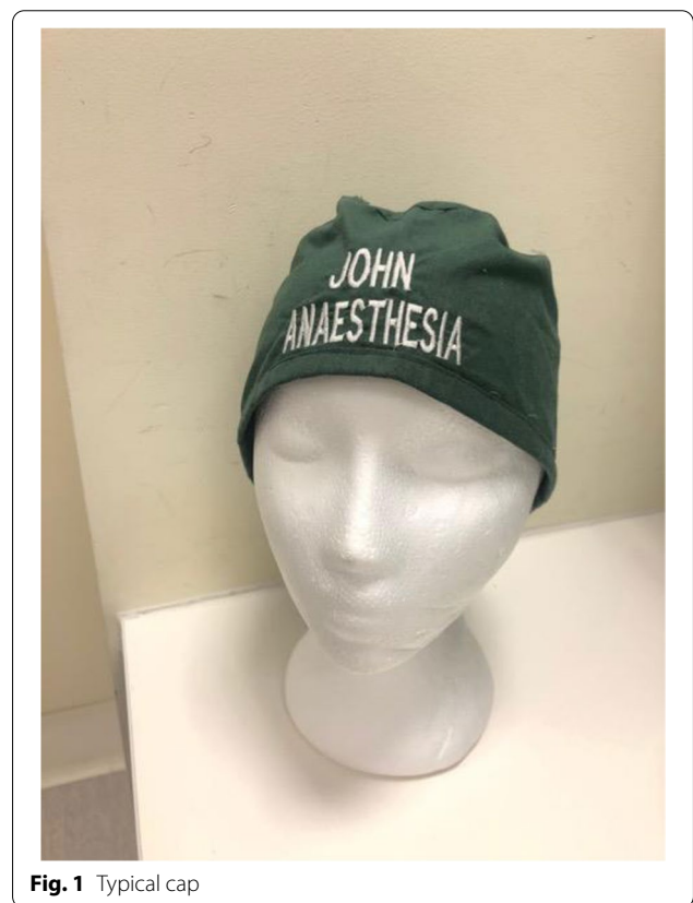
Fig. 1 Typical cap

The primary outcome was the perceived teamwork score rated using a 5-point Likert scale, where 1 represented completely unsatisfactory teamwork and 5 represented completely satisfactory teamwork. The median